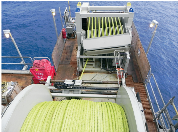
Logan's winch design includes a storage reel with capacity for 9,200 feet of 2-1/2" diameter Quantum-12 high-performance rope. Quantum-12's superior bend fatigue properties allowed a significantly smaller diameter traction head, reducing weight.

For more information on Samson's complete line of high-performance ropes visit our website, www.SamsonRope.com , or contact our customer service department.